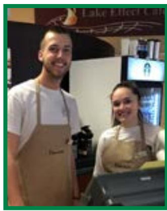
Lake Effect Cafe - Penfield Library