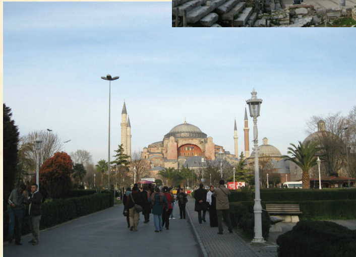
Hagia Sophia -- Istanbul