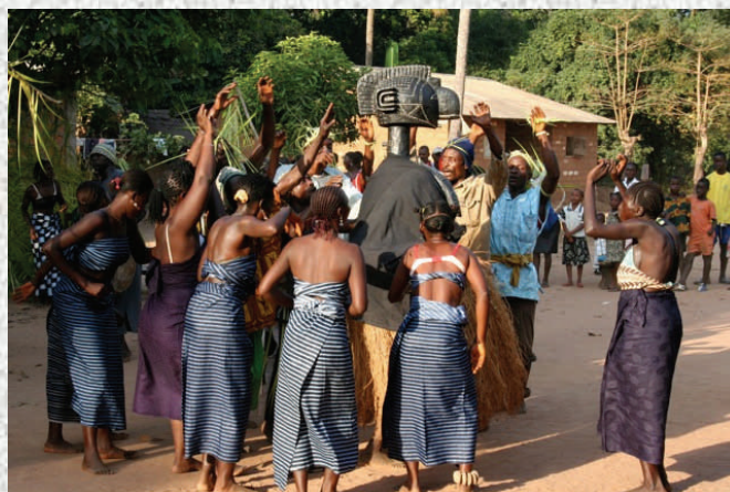
Dance of the Baga mask D'mba, village of Katako, Guinea, 2008