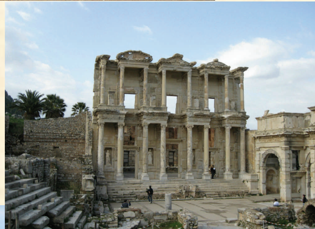
Ephesus Ruins -- near Izmir, Turkey