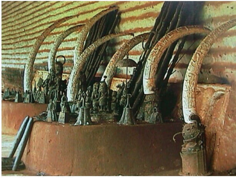
ROYAL ANCESTRAL ALTAR, BENIN CITY, NIGERIA