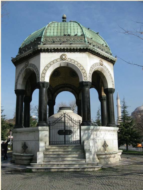
Hippodrome -- Istanbul