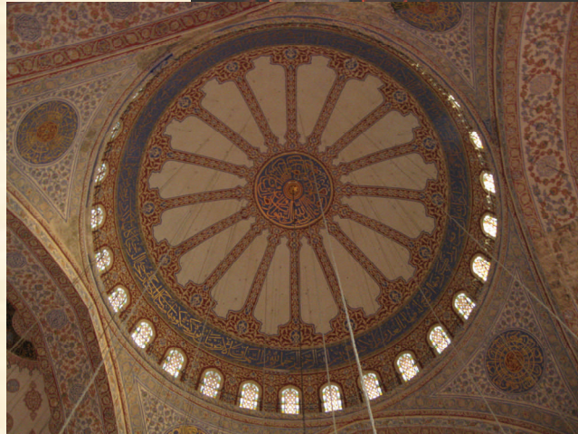
Blue Mosque -- Istanbul