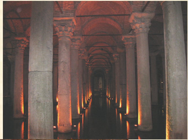
Basilica Cistern -- Istanbul