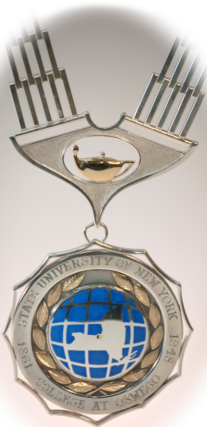
The College Medallion