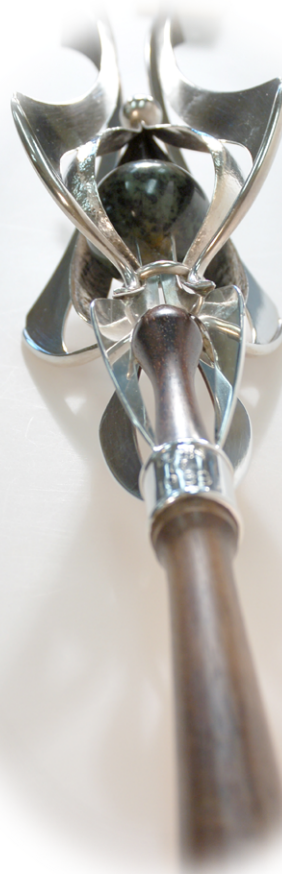
The College Mace