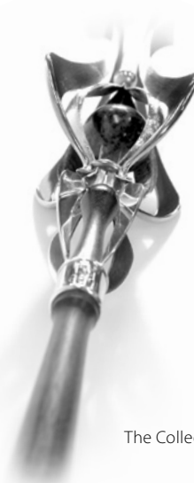
The College Mace